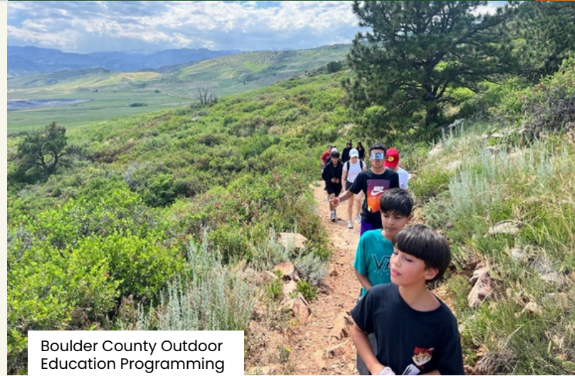
Boulder County Outdoor Education Programming